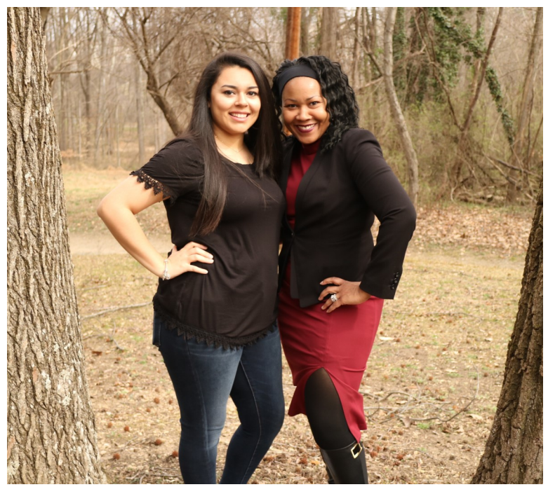
decide to become a Sponsor, you will receive support, love, and encouragement from the Generation Hope family."

"Just do it! The Generation Hope staff will give you the support and encouragement that you need to overcome any challenge or fear that you may have. Whether you start small by volunteering at events or