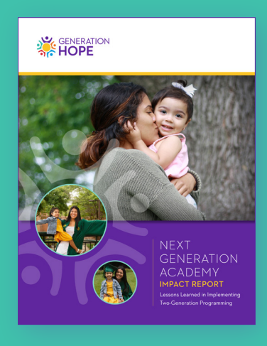
Next Generation Academy Impact Report