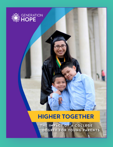
Higher Together: The Impact of a College Degree for Young Parents